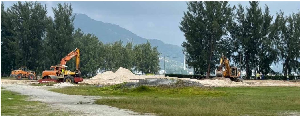
They are extracting sand from one outer island. Guess which one?

selves. Let's hope Seychelles gets a quality stadium to welcome FIFA and other contestants for the tournament and does not later discover it was a second-hand purchase that allowed someone to pocket '10%' of the deal. We hear this is how some of them do it—they take a 10% cut on every government project. With sponsors, FIFA, and others likely pouring money into this project, we can only imagine how their eyes light up with opportunity. The public remains vigilant, ready to see if politicians try to get their hands into this cookie jar.