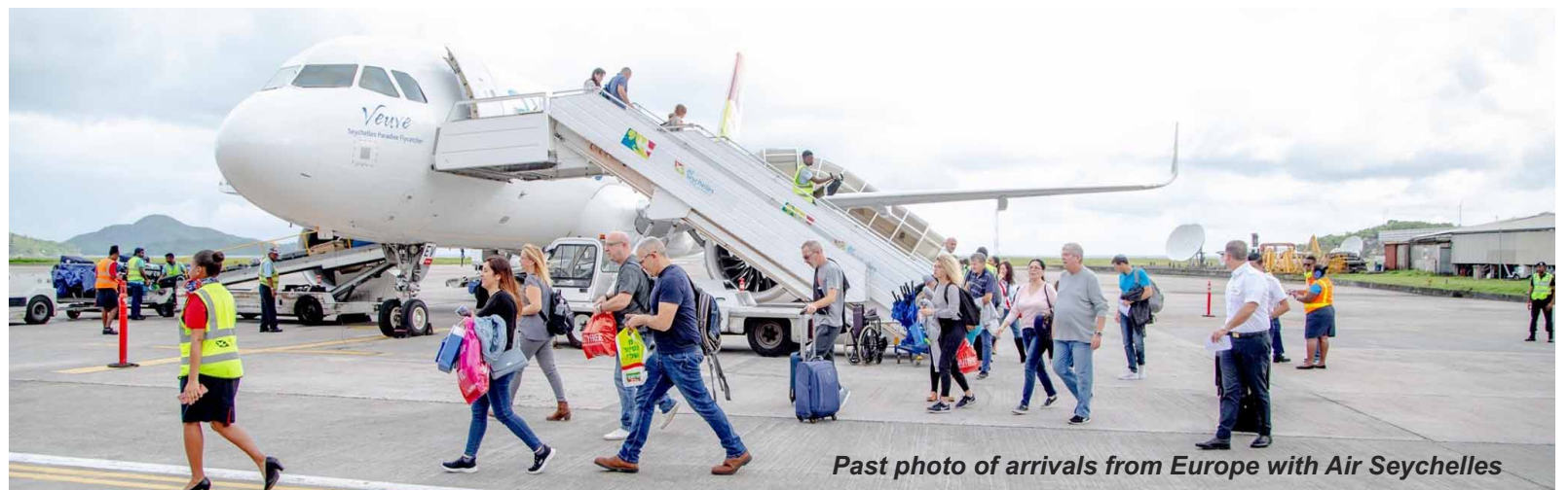
Past photo of arrivals from Europe with Air Seychelles